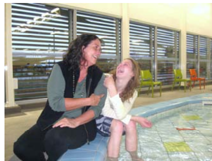
Mentor & Young Person enjoying a laugh at the pool party