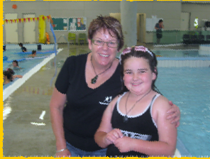
Ondy with a young person "hanging out" at our pool party

We have 22 matches and 7 young person's awaiting a match. I am always recruiting male and females for our programme. We are in need of good men! as I have young males waiting for a Big Brother. So if you enjoy having fun and enjoys sports, fishing or the outdoors and would like to make a difference in a young persons life, please contact me.